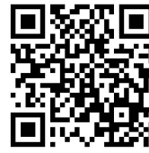
SCAN TO JOIN